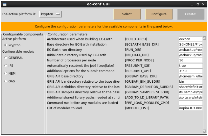
Configuration panel of the ec-conf GUI

and target files that are specified in the current XML data base file. They can individually or collectively be activated or deactivated by clicking the appropriate check buttons. Thus, it is possible to selectively create configuration files by clicking the Create! Button. Moreover, the file name and path of every configuration file (target) can be changed. This allows a very fine level of control over the configuration files that are created by ec-conf.